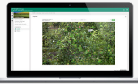
Photo with recognized fruits and measurements of fruit diameters (apple only).

1. Control unit; 2. Power supply (solar panel and battery); 3. Dual antenna (GPS/ communication); 4. Logger and modem; 5. Zoom lens; 6. Wide angle lens.